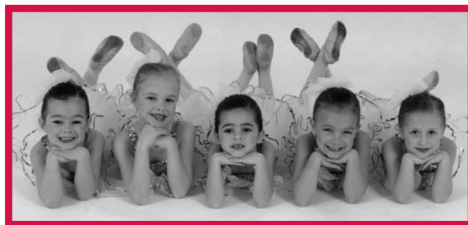
First steps: Summer classes are a great way to introduce little ones to the art of dance.

Classes are held on Tuesday, Wednesday and Thursday, leaving long weekends free for family activities. Classes also tend to be smaller compared with the school year, making for an even more intimate learning environment.