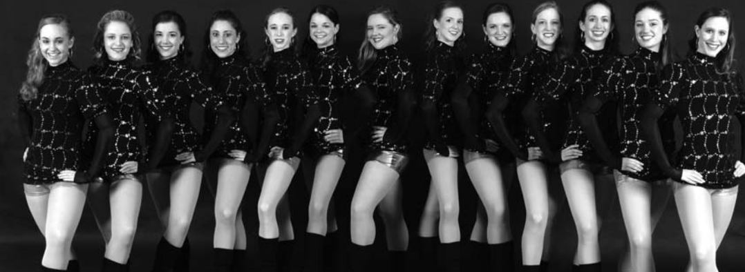
Dancers from Tappin' 2008 number "Eruption."

Reserved seats for Tappin' 2008 are still available. Tickets are $18.75 in advance and $20 at the door. To order tickets, call 533-1111.